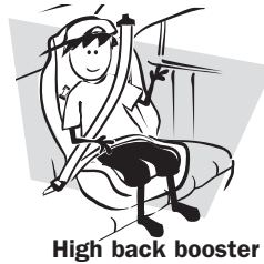
High back booster